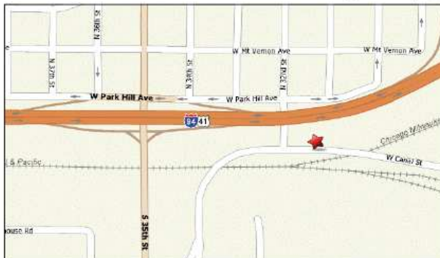
Map of 3001 W. Canal St., Milwaukee, WI by Mapquest - http://www.mapquest.com