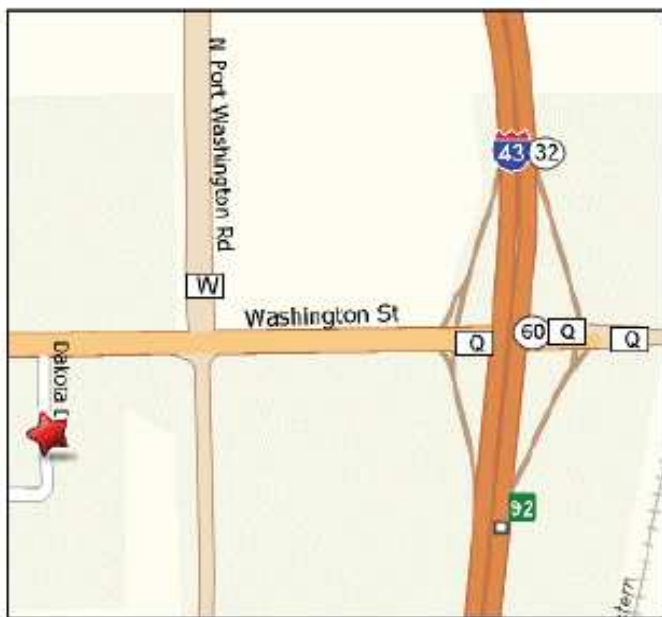
Maps of 1272 Dakota Dr., Grafton, WI