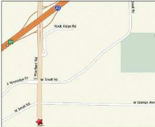
Map of 5555 S. Moorland Rd., New Berlin, WI by Mapquest http://www.mapquest.com