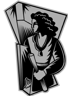
Analyze your career choice

To see resume samples and read more job-search tips visit www.AlphaAdvantage.com Deb@AlphaAdvantage.com