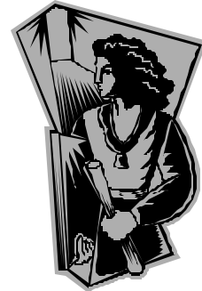
Take on new projects

Accountemps is the world's first and largest temporary staffing service specializing in the placement of accounting, finance and bookkeeping professionals. For more information, call the Milwaukee office at (414) 271-8367.