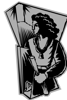
Use e-mail to summarize an action taken or a decision that has been made